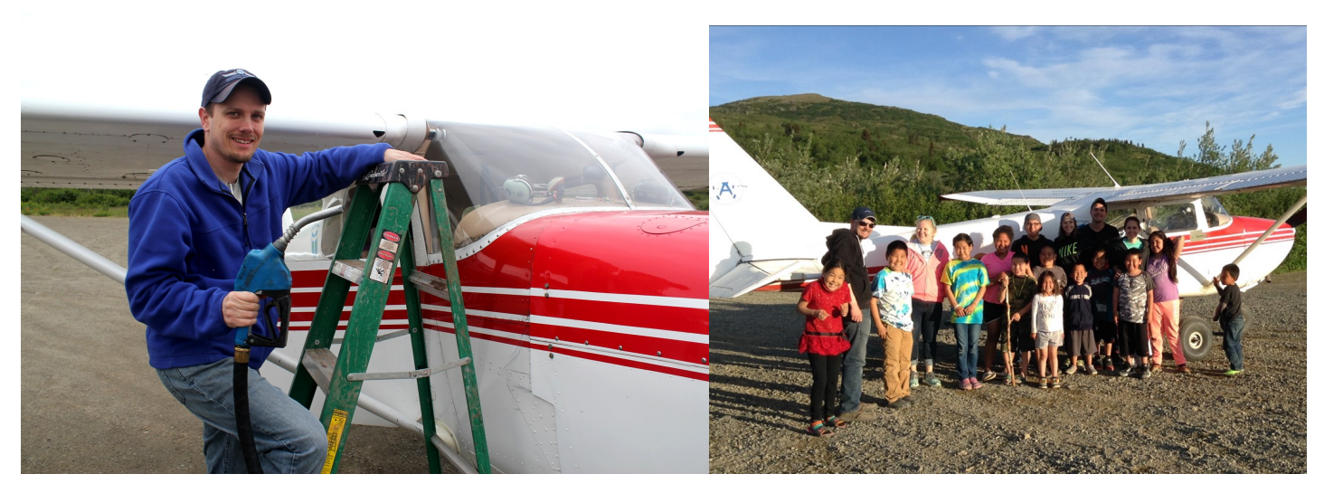
VBS team and Pastor Jeremy with youth in Manokotak

Between the three airplanes, FLAPS uses approximately 1,500 gallons of aviation fuel each year in Alaska. That's an estimated 150 hours of flight time dedicated to ministry! Because airplanes require specially refined fuel, cost per gallon is higher than normal car fuel.