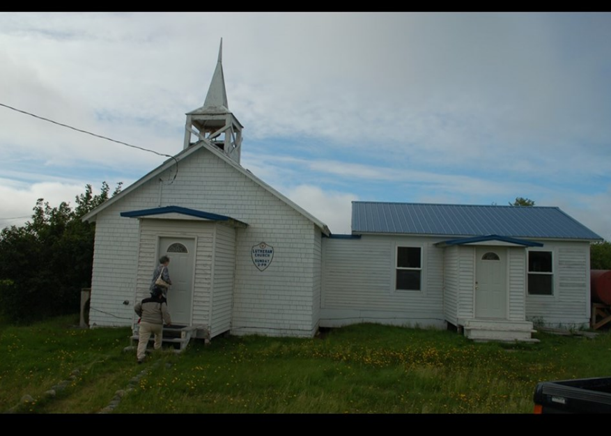
South Naknek Church

"Yet those who wait for the Lord will gain new strength; they will mount up with wings like eagles, they will run and not get tired, they will walk and not become weary." Isaiah 40:31