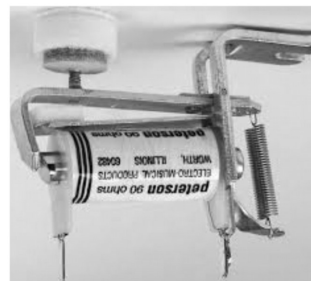
Illustration 2: Peterson version of chest magnet. Note the more robust coil spring.

*Data provided to AFLC Development Department by FLBCS 11.3.21